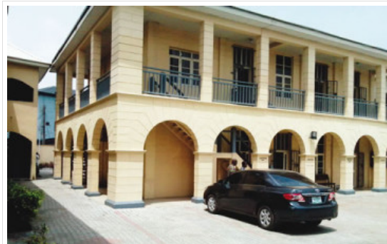
Ebute Meta Magistrate Court