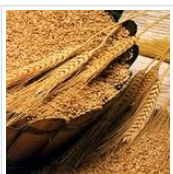
Grain markets gain further ground