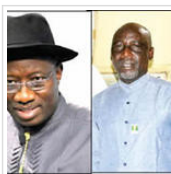
How government agencies fleece job seekers