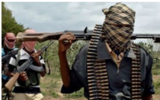
Boko Haram members

The campaign against insurgents in the North-East intensified with the capture of a top leader of Boko Haram and the killing of about 70 insurgents at the sect's stronghold in Gwoza Hills, Borno State.