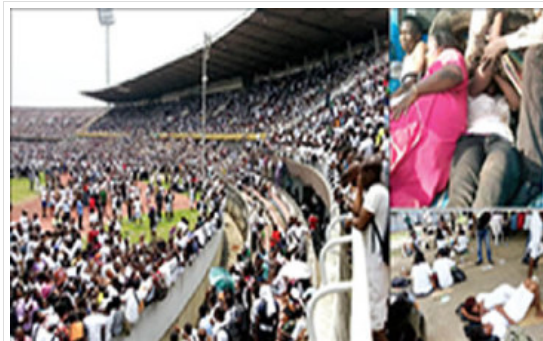
Clockwise: Applicants at the National Stadium, Lagos; some of the injured applicants in Abuja; and exhausted applicants in Lagos, on Saturday