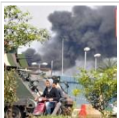
Death toll rises in northern Lebanon clashes