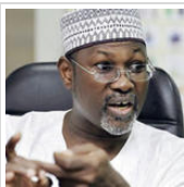
2015: Lawmaker accuses INEC of insincerity