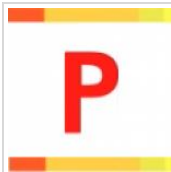
Car theft: Court sentences man to three months in jail