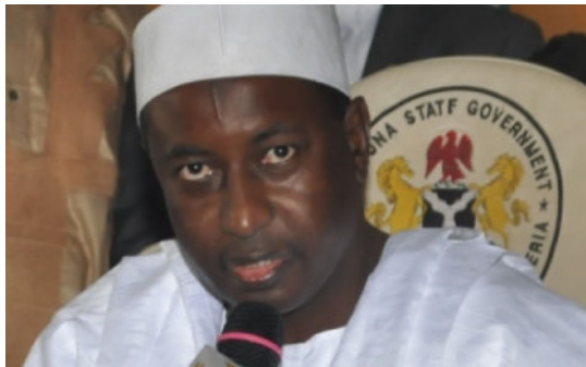
Governor Mukhtar Yero of Kaduna State

At least 100 people were killed when some gunmen attacked three villages in Kaura Local Government Area of Kaduna State in the early hours of Saturday.