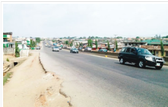
Scene of the crash.