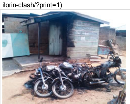
Some of the motorcycles

( http://www.punchng.com/metro-plus/policeman-feared-dead-motorcycles-destroyed-in-ilorin-clash/?print=1 )