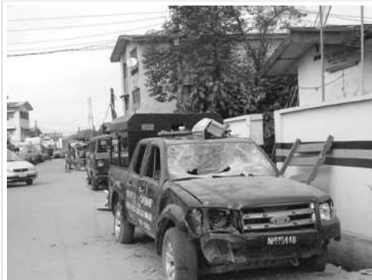
One of the vandalised vehicles at Iwaya Police Post