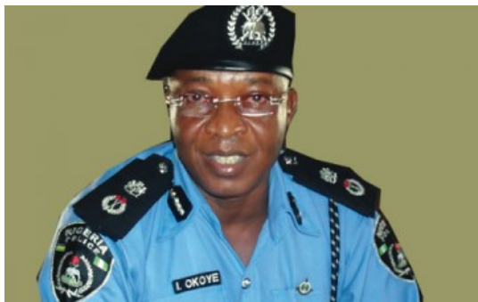
Ogun State Commissioner of Police, Ikemefuna Okoye

Tension gripped three communities of Onihale, Ilepa and Aiyede in Ifo Local Government Area, Ogun State on Wednesday as scores of rampaging youths sacked residents over the alleged killing of a landlord by a night guard.