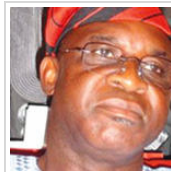
Power equation and looming defection in Senate