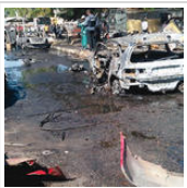
Suicide bomber kills 30 in Maiduguri