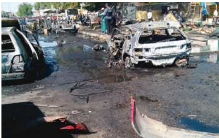
A scene of the bomb blast in Maiduguri, Borno State ... on Tuesday.