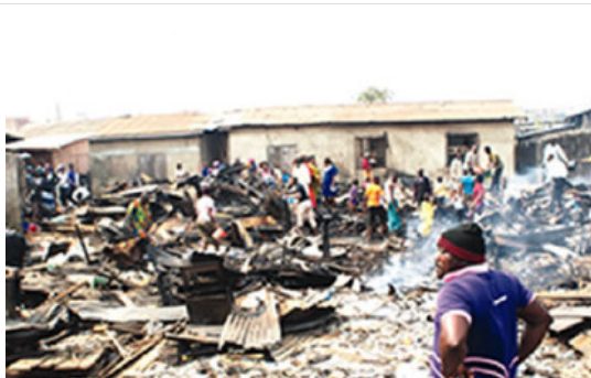
Scene of the incident