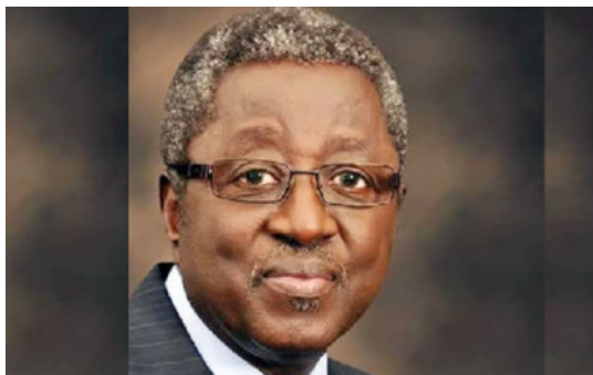
Plateau State Governor Jonah Jang

No fewer than 30 people were reportedly killed and 25 others injured on Monday when gunmen struck at Shonong in Bachit District of the Riyom Local Government Area of Plateau State.