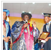
He lost passion for Medicine, made First class in Economics