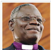
Ex-Anglican primate, Akinola, abducted, rescued