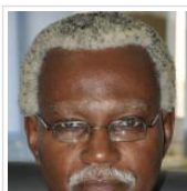
ICPC to prosecute 156 firms for procurement offences