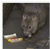
Deadly disease hits Madagascar