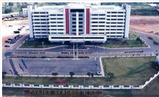
Police National Headquarters, Abuja.