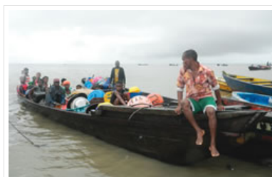
Some residents fleeing the communities