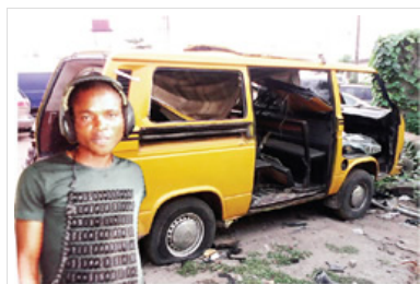
The hit-and-run bus