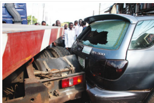
An accident scene

An Owo-bound truck on Wednesday lost control and collided with an oncoming car. It resulted in the death of two persons, while others were injured.