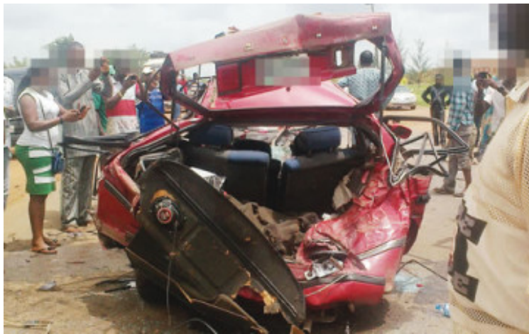
An accident scene.

76 Comments ( http://www.punchng.com/metro/two-die-as-govt-convoy-causes-accident-in-lagos/#comments )