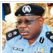
Police arrest five for raping nine-year-old girl