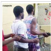
Lagos prison escapee steals 20 cars