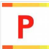
Man escapes from Lagos prison, steals 20 cars