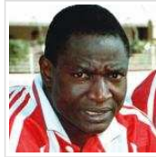
FIFA president remembers Yekini