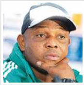
Keshi's unpaid salaries spark uproar