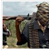
Scores feared dead as B'Haram attacks Yobe police station