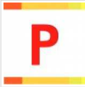
Military task force declares 24-hour curfew in Yobe