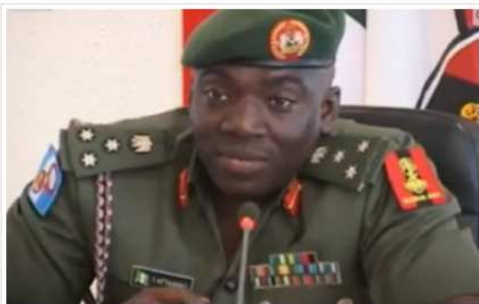
Director Army Public Relations, Brigadier-General Ibrahim Attahiru

A retired lieutenant colonel, who was said to have led the Boko Haram attacks on Damaturu, Yobe State, on Thursday was arrested by security forces during the encounter.