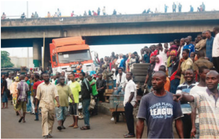
Onlookers around Marine Bridge.

power-bikes-attack-bullion-van/#comments)