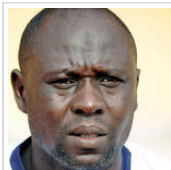
Odini, Oguntuase tip Eagles to beat Sweden