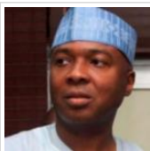
Sallah tragedy: Group mourns victims, faults Saraki critics