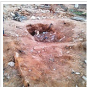
Ogun exhumes corpses during demolition exercise