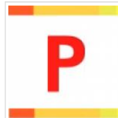
Kidnappers of Osun Speaker's wife jailed 27 years