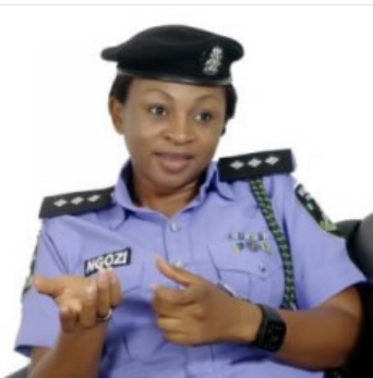
The PPRO for Lagos State police command, Ngozi Braide.