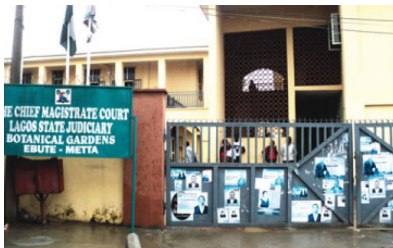
Ebute Meta Chief Magistrate Court

arraigned-for-killing-man-who-rejected-invitation/#comments)