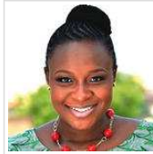
Why maternal mortality is high — Experts