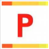
India jails six over Swiss gang rape