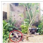
Man tortures son to death, buries corpse