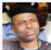
Workers protest nurse's beating