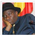
Yobe killings barbaric, wicked — Jonathan