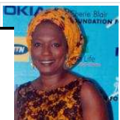
his Mu Jhamr ughte