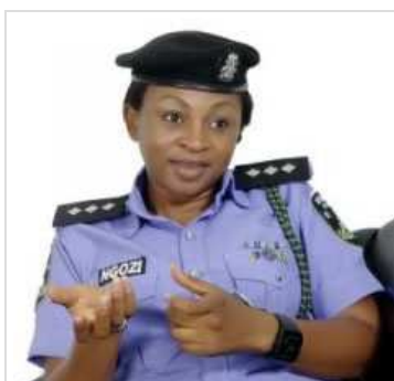
The PPRO for Lagos State police command, Ngozi Braide.

JUNE 29, 2013 BY KUNLE FALAYI 8 COMMENTS