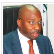
Inflation rate dropped to 9% in May — NBS

Most Read Recent Comments Most Commented