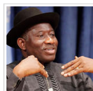
NWC members beg Jonathan for appointments