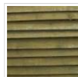
Plateau: Residents flee over rumours of attack