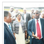
NUC, police to probe UNIUYO riot, student's death