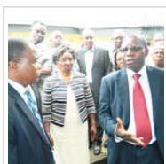
NUC, police to probe UNIUYO riot, student's death