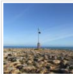
'I stripped naked on oath for my husband'