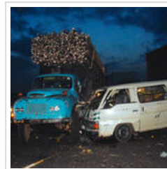
One feared dead in Berger Bridge accident