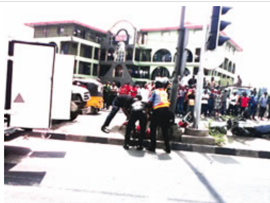
Scene of the accident