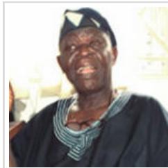
Nigeria must prosecute IBB, Obasanjo – Opadokun