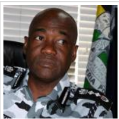
Police stray bullet kills nine-year-old in Lagos