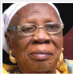
Tinubu's mother, Abibatu Mogaji, dies at 96