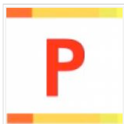
Man arrested for raping seven-year-old girl in Calabar