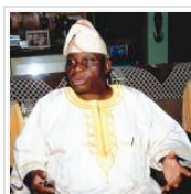
Eagles did well at Confed Cup – Are