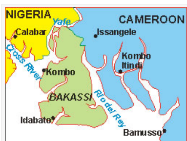
Map of Bakassi