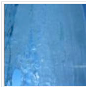
EU clears ICE's $8.2bn takeover of NYSE Euronext