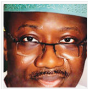
Tension persists in Ekiti community