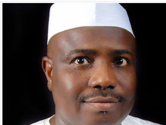
Speaker of the House of Representatives, Mr. Aminu Tambuwal