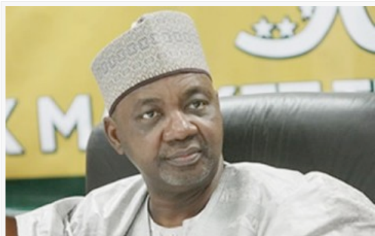
Vice-President Namadi Sambo