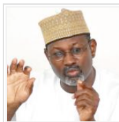
Jumbo pay tears electoral commission apart