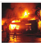
Fire guts Alade Market