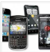
Shielding yourself from smartphone snoops (1)