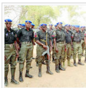
State police: To be or not to be