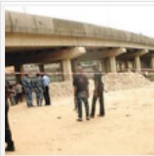
Lagos explosion: Police quiz victim's callers