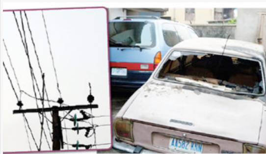
The high tension cable and the damaged vehicle.

FEBRUARY 1, 2013 BY ENIOLA AKINKUOTU • 2 COMMENTS