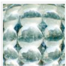
Group hails arrest of bombing suspects