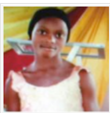
Man kills 12-year-old girl over N800 debt