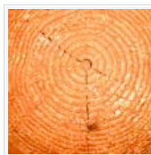
Man United cruise past poor Wigan