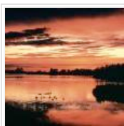
Helicopter carrying Kaduna gov, ex-NSA, others crashes in Bayelsa