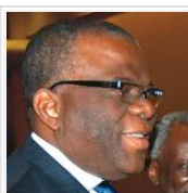
Villagers recount last moment of crashed helicopter