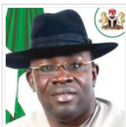
Dickson declares three-day mourning, weeps