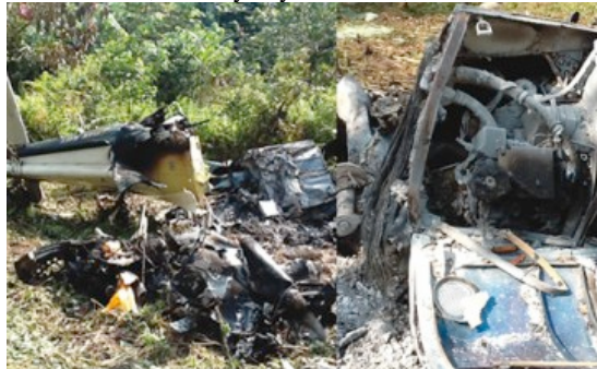
Wreckage of the crashed Augusta 109 Helicopter in Okoroba, Bayelsa State