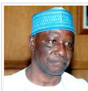
Crash: Aviation group wants uniform monitoring of aircraft