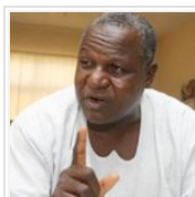
Kaduna declares seven-day mourning