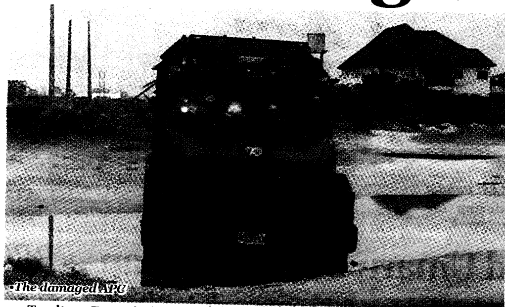
•The damaged APC