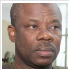
Why we embraced GIS for land management — Ogun