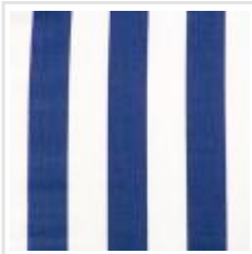
Ondo residents celebrate Mimiko's victory