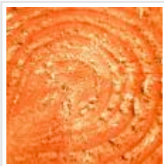
Sheila, Tai Solarin's widow, dies at 82