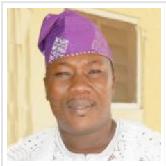
Wife of Osun Speaker kidnapped