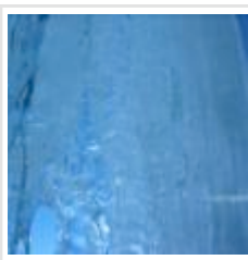
NYSC excludes Borno, Yobe from postings