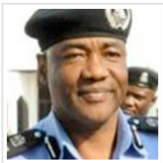
Gunmen kill 23 students, others in Adamawa