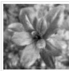
Venezuelan opposition wants deaths probe, Chavez vows to improve