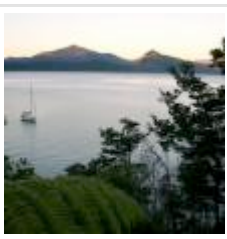
Gunshots cause fresh scare in Lagos