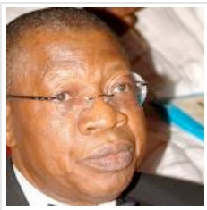
Nigeria@52: ACN urges Nigerians to fight for independence from 'internal colonialists'