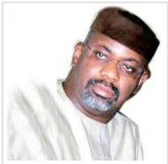
Bakassi, threat to Nigeria's territorial integrity – Imoke