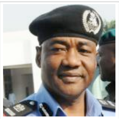
Terrorism: Jonathan to mark Independence within Villa