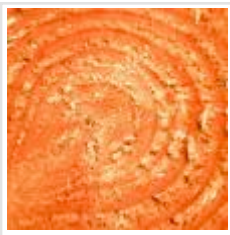
Nigerians in US mark Independence Day