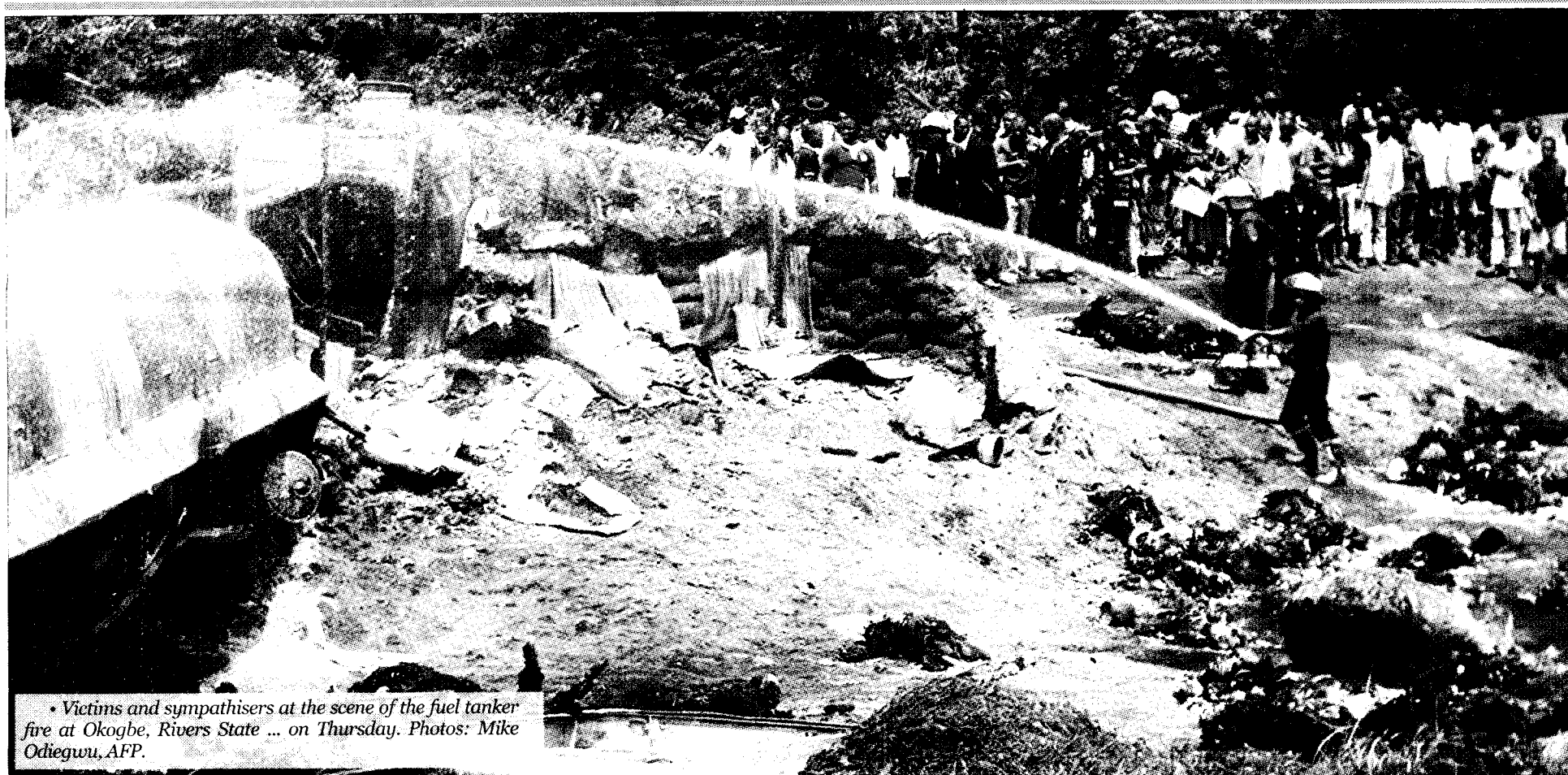
• Victims and sympathisers at the scene of the fuel tanker fire at Okogbe, Rivers State... on Thursday.