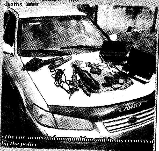
The car, arms and ammunition and items recovered by the police

The PPRO also confirmed that the clash was between Downtown boys and Shaggy boys. She however said she could only confirm two deaths.