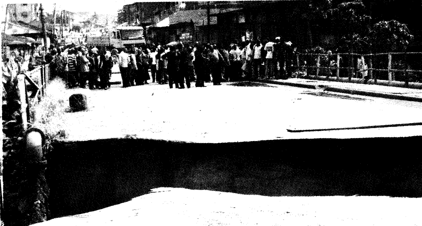
•Different sections of the collapsed bridge.