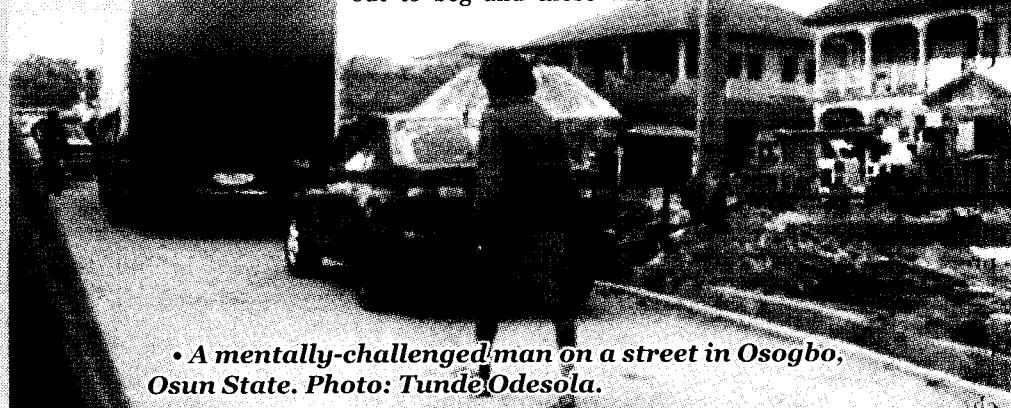
• A mentally-challenged man on a street in Osogbo, Osun State.

The Commissioner for Information and Strategy, Mr. Sunday Akere, said the state government had equipped a home for the