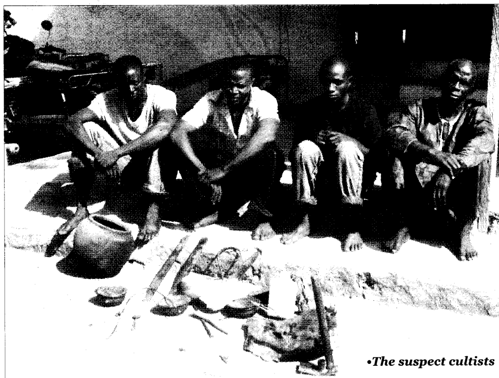
•The suspect cultists